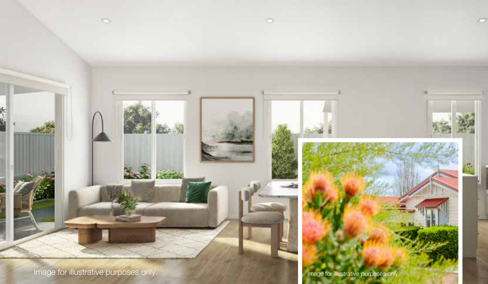
Image for illustrative purposes only.